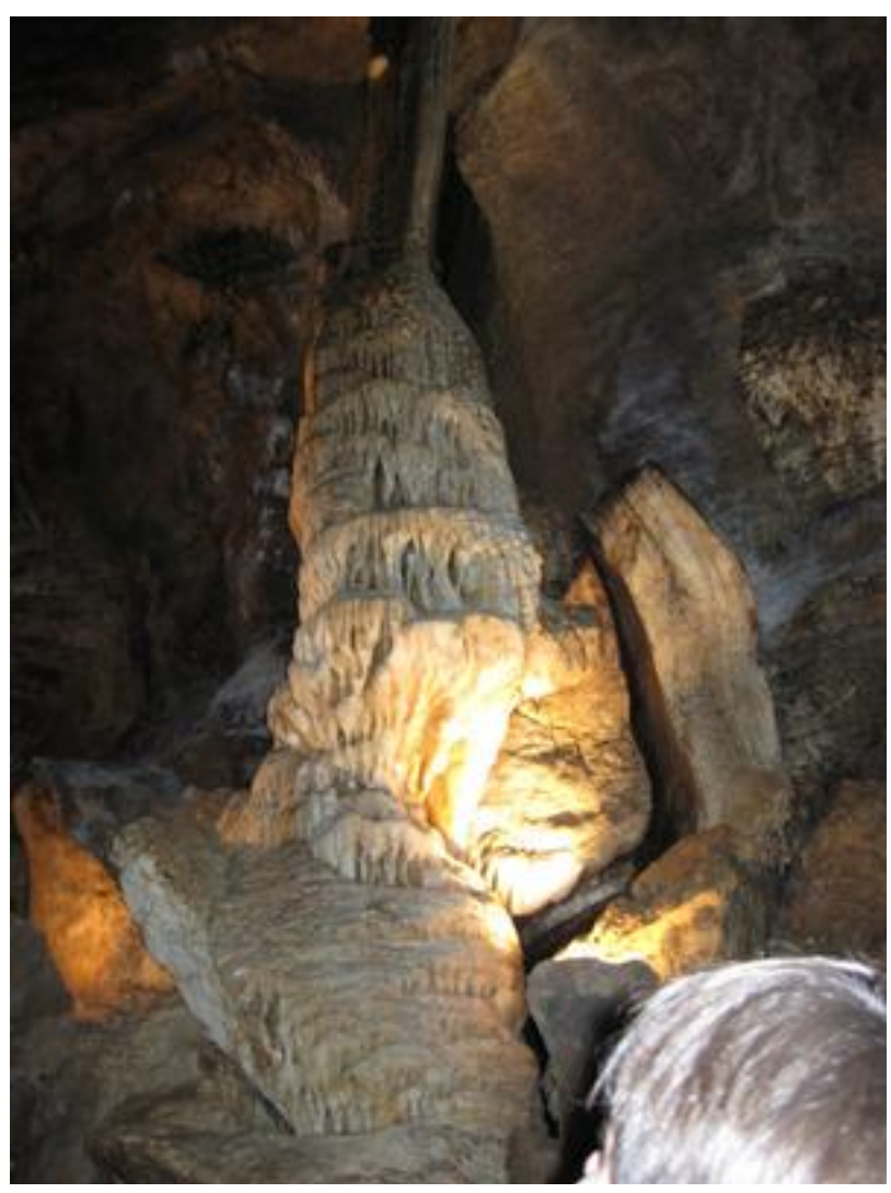
• If a shark appears, you will be eaten and die. If you swim for too long, you will get tired, drown, and die.